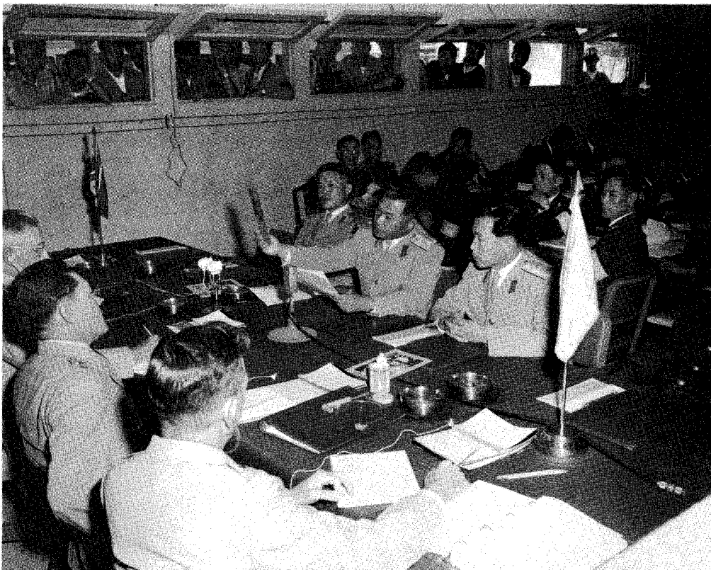
A meeting of the Military Armistice Commission at Panmunjom

ways: the note at Panmunjom, armed escorts, and a naval show of force off the North Korean coast.