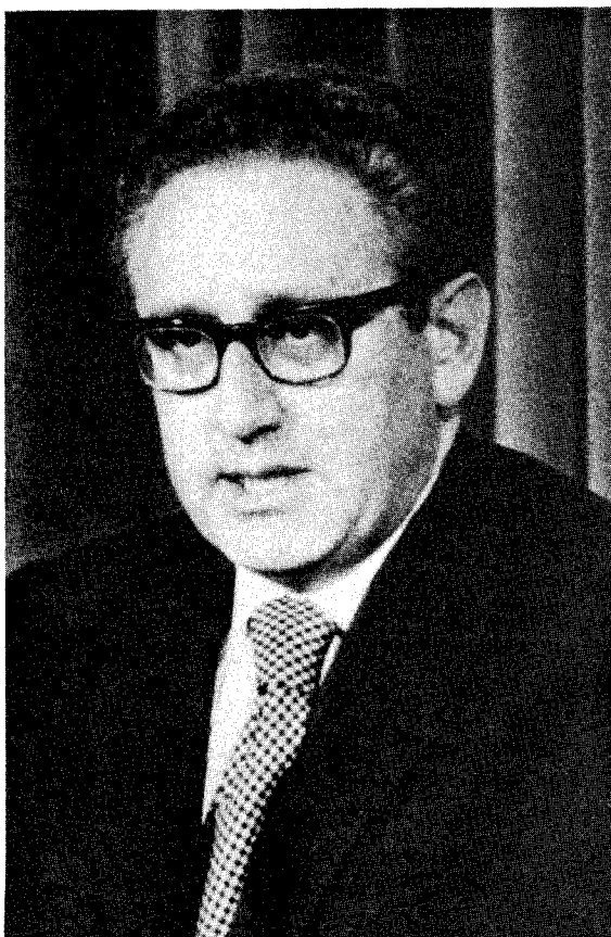
Henry Kissinger, national security adviser to President Nixon in 1969

Dismayed by the lack of support for their aggressive ideas, Nixon and Kissinger relented. On 18 April, the president announced that armed escorts would accompany future U.S. reconnaissance flights in the vicinity of North Korea. He also told the UN representative to the Military Armistice Commission to deliver what Nixon called “a very weak protest” to the DPRK general at Panmunjom.